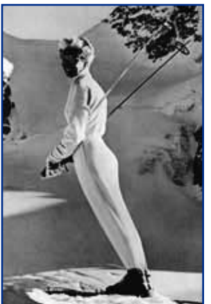
Since the invention of Maria Bogner's original ski stretch pant, Bogner has stood for quality, style and performance in skiwear.

Big Sky Resort is developing the north side of Lone Peak for the 2003/2004 ski season adding over 1,000 new acres. The expansion will include a 2 mile long, six passenger high speed lift accessing new intermediate and advanced terrain.