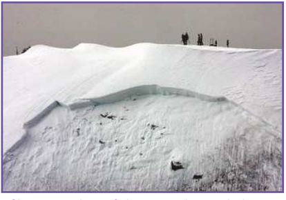
Signs warning of dangers pictured above are posted at resorts. But is it enough?

than 150 lives worldwide, a number that has been increasing over the past few decades. In addition thousands more are caught in avalanches, partly buried or injured, according to the National Snow and Ice Data Center at the University of Colorado.