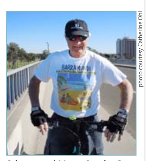
Biking around Mission Bay, San Diego.

We've been working with the Radar River Rats on our summer water ski trips. We have once again scheduled nine trips for June through October. We set camp up on our own beach on the Colorado River, 10 miles east of Needles. Equipment and instructions are available. Details, dates and cost can be found on page 2.