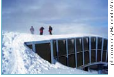
This winter Mammoth had more snow than any other resort in the WORLD.

On February 19, 2011, masked gunmen shot and killed three tourists on their way to Mt. Elbrus ski resort in the