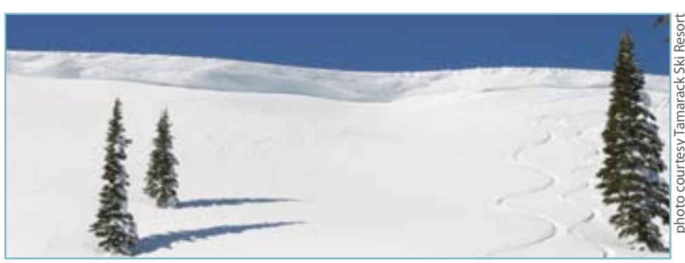
Untracked powder at Tamarack— three days after the storm.

Tamarack Resort has been removed from federal Chapter 11 bankruptcy protection and sent back to the state court. Credit Suisse is petitioning to convert the case into a Chapter 7 liquidation or be allowed to begin foreclosure proceedings. The resort's total debt is reportedly more than $350 million, $256 million of that to Credit Suisse and its investors.