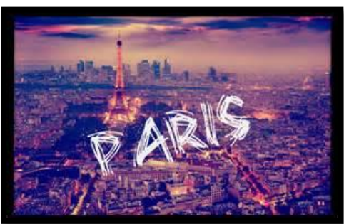
FREE TIME TO EXPLORE!