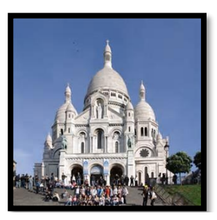
Experience Local Culture